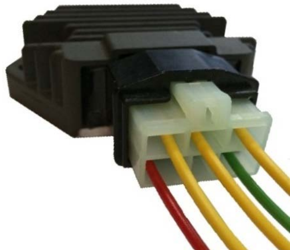
A Front view of the regulator

When connecting the fastons, Make sure that the stripped wires do not cross the red line (see picture). The fastons will not properly fit in the contra-connector if the wires cross the red line.